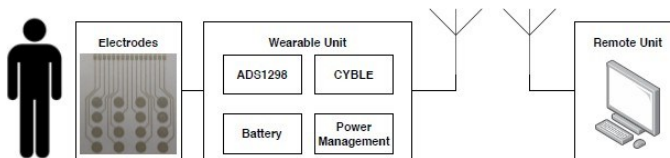
Fig. 1. The architecture of the system.

The overall system's architecture (Fig.1) consists of two main parts: a wearable unit and a remote one. The former acquires signals from the human body through the electrodes, converts them to digital ones and sends them through Bluetooth Low Energy (BLE) to the remote unit that is devoted to store the data, perform pre-processing steps and provide the results to custom applications.