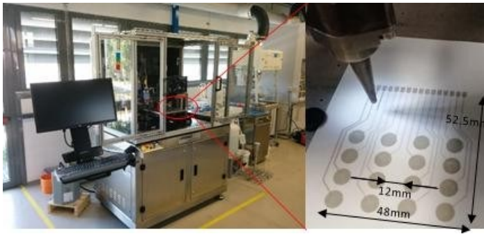
Fig. 2. Matrix electrode during the fabrication

With this technique, it is possible to deposit a wide set of inks in a low-temperature environment on substrates that are not conventional for electronics, like plastic sheets and paper. The matrix of 16 electrodes was printed (Fig.2) using the Novacentrix Metalon HPS-108AE1, silver nanoflakes based ink on a photographic paper. This combination allows to achieve flexibility, low-cost, biocompatibility and sustainability (it can be burned after use) and thus simplifies the adhesion between the electrodes and non-planar surface of the body.